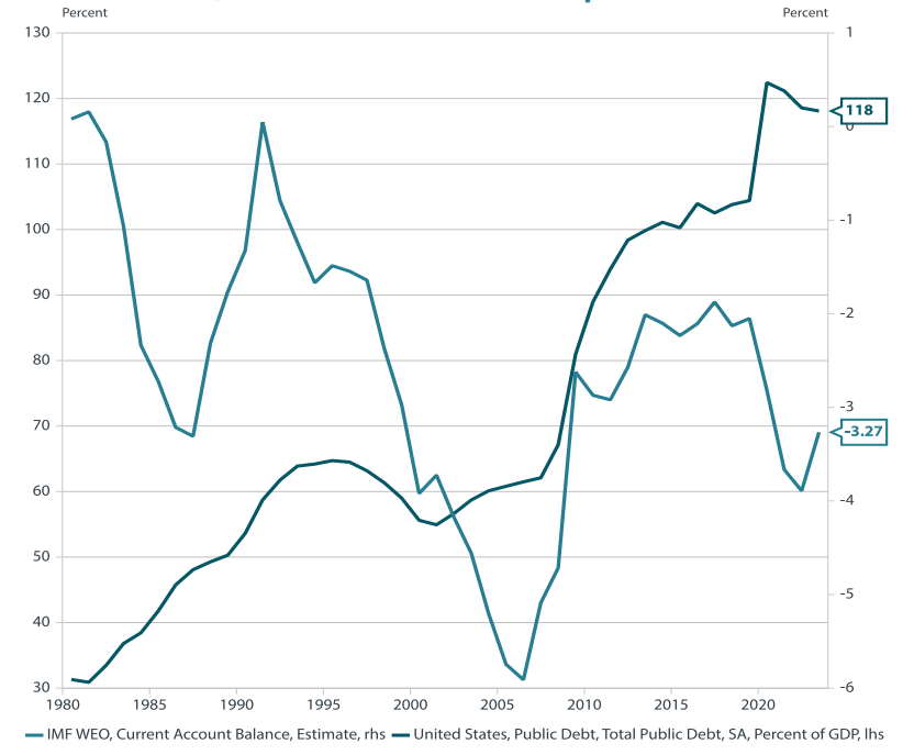
Chart 1: US debt, current account balance as percent of GDP

As we near the end of 2024, anticipation of growth-enhancing policies associated with Donald Trump's return to the US presidency are boosting equity markets. Prior to the US election the stock and bond markets had priced in contrasting economic scenarios, with bonds pricing in a significant growth slowdown yet equity valuations getting increasingly richer. In the short term, Trump's win put an end to the speculation that weak underlying growth would spur aggressive and rapid rate cuts from the Fed. However, caution may be warranted as already stretched US stock valuations have continued extending, even as the US debt-to-GDP ratio has effectively reached historical highs of 120% (Chart 1). Nikko AM's Global Investment Committee (GIC) had, prior to the election, judged that tail risks, such as disruptions to the US yield curve, have risen. The unexpectedly strong mandate that US voters gave the Republican Party has meanwhile lowered the risk of near-term Congressional conflict over the debt ceiling, and at the same time, increased the tail risks inherent in the combination of anticipated fiscal easing and an already stretched US fiscal position.