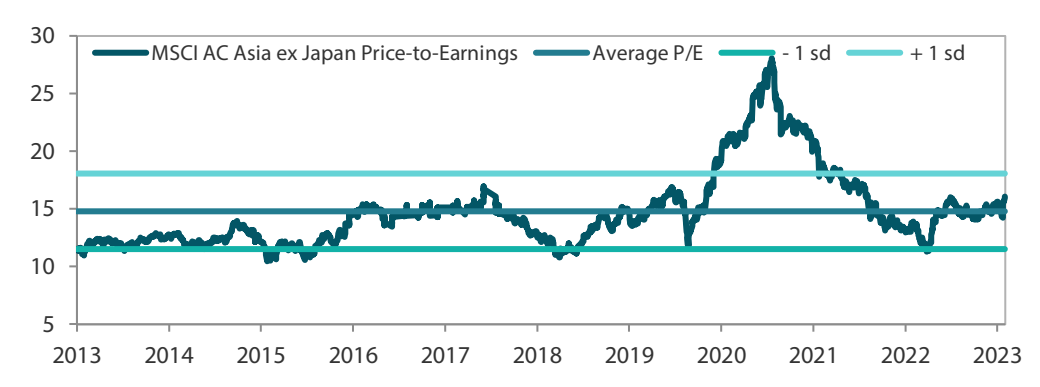
Chart 4: MSCI AC Asia ex Japan price-to-earnings

Ratios are computed in USD. The horizontal lines represent the average (the middle line) and one standard deviation on either side of this average for the period shown. Past performance is not necessarily indicative of future performance.