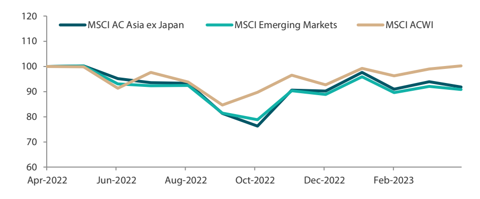
Chart 1: 1-yr market performance of MSCI AC Asia ex Japan vs. Emerging Markets vs. All Country World Index

Returns are in USD. Past performance is not necessarily indicative of future performance.