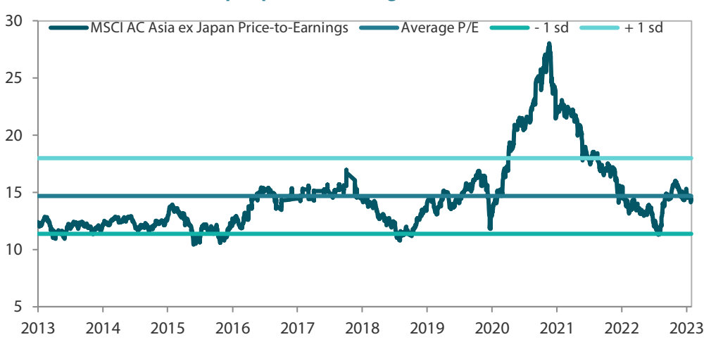
Chart 4: MSCI AC Asia ex Japan price-to-earnings

The stars are now seemingly aligned for countries like India and Indonesia. Not only do they have the cheap excess workers needed by the world, but these workers are also more skilled than ever as a result of structural reforms boosting productivity. These reforms also have the effect of loosening bottlenecks on foreign domestic investments inflow, just as geopolitics in the form of "China Plus One", which is now bringing businesses to their doorsteps. The aforementioned factors continue to drive our favourable view of high-quality banks and companies leveraged to domestic consumption in India and Indonesia.