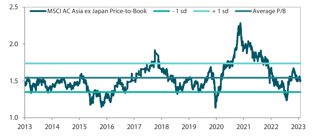
Chart 5: MSCI AC Asia ex Japan price-to-book

Ratios are computed in USD. The horizontal lines represent the average (the middle line) and one standard deviation on either side of this average for the period shown. Past performance is not necessarily indicative of future performance.