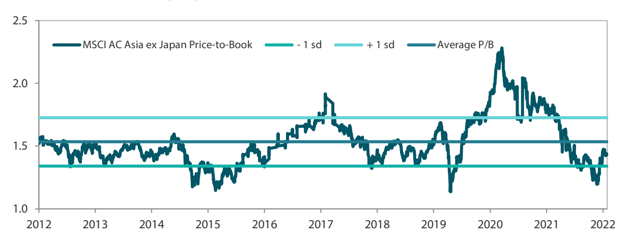
Chart 5: MSCI AC Asia ex Japan price-to-book

Ratios are computed in USD. The horizontal lines represent the average (the middle line) and one standard deviation on either side of this average for the period shown. Past performance is not necessarily indicative of future performance.