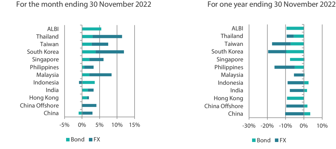
Chart 1: Markit iBoxx Asian Local Bond Index (ALBI)

Source: Markit iBoxx Asian Local Currency Bond Indices, Bloomberg, 30 November 2022